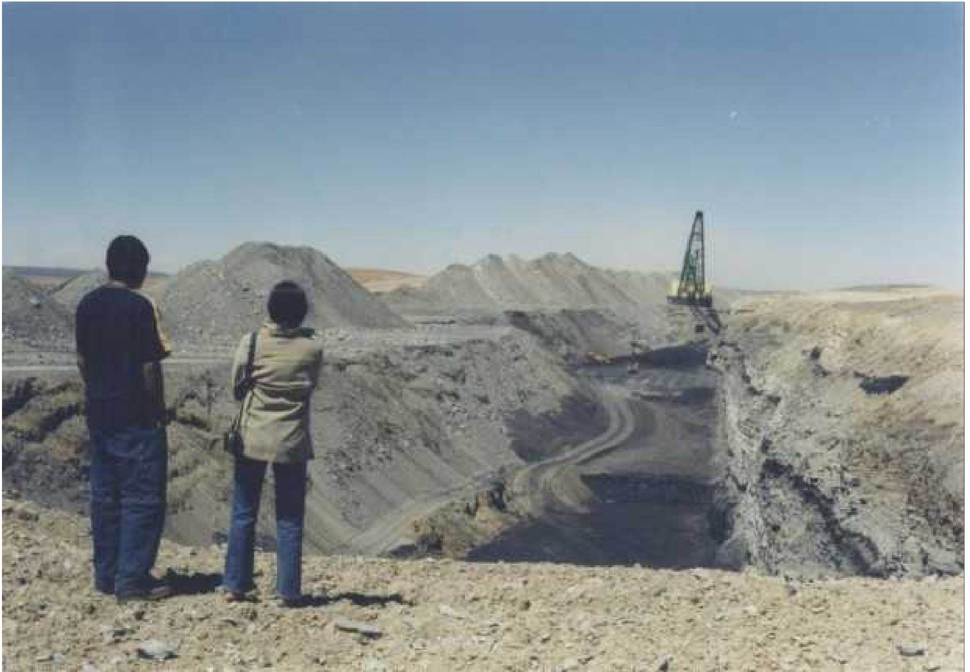
BMWC founders observing the Black Mesa Mine in Black Mesa, Navajo Nation