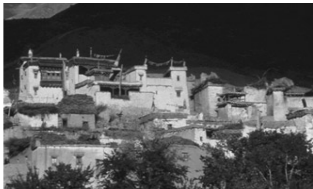
Traditional Ladakhi village

Since we began the Learning from Ladakh (LFL) program over fifteen years ago, Ladakh has proved to be an ideal place to experience the clash between a local land-based economy and the pressures of the global economy. That clash can, at times, feel overwhelming and depressing, the destruction unstoppable. Even still, there is great cause for optimism: not everything has been lost, and opportunities remain for Ladakh to develop in a way that respects its culture, its people, and the natural environment.