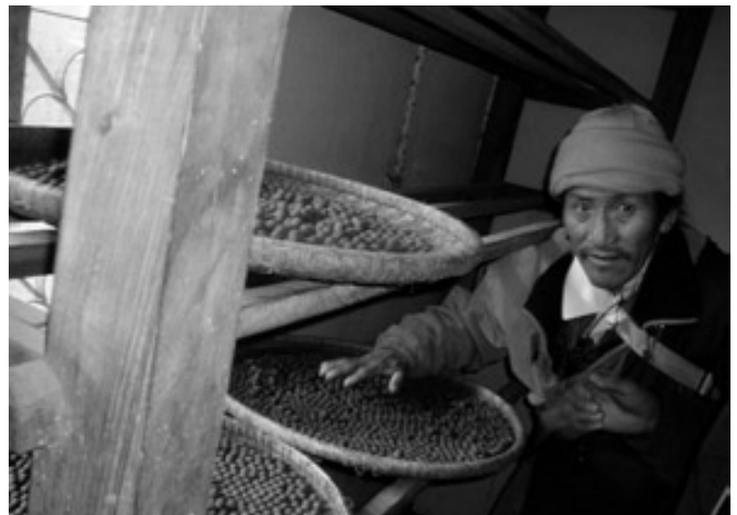
Preparation of Tibetan herbal pills

Supporting other NGOs A few years ago we received funding, through ISEC, from the Flow Fund, which we then passed on to worthy groups whose work we admired. Among the local NGOs receiving funds were those involved in leadership education of youth in Nepal, in the revitalization of Tibetan traditional medicine, and in preserving the orally transmitted tales of the Mangyan ethnic group in the Philippines. We continue to support and collaborate with several of these groups.