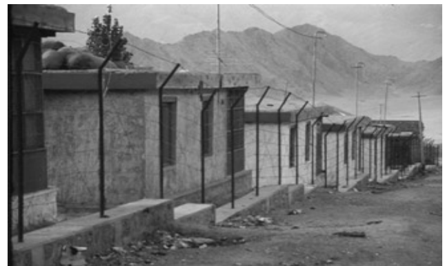
Modern housing development

Yet, I realize that however bad things are getting in Ladakh, they are still very far from the state we have arrived at in most of the so-called developed world. If oil were to run out tomorrow, Ladakhis would, I believe, still be able to manage. Every year that these destructive trends continue, however, life in Ladakh will become ever more insecure and vulnerable. For this reason,